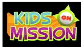
LifeWay Kids at Home | Missions Video - 03-22-20