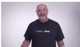
LifeWay Kids at Home | Introduction and Instructions