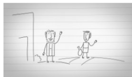
LifeWay Kids at Home | Jesus Told Three Parables - 03-22-20