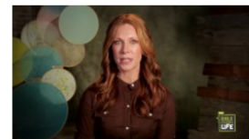
LifeWay Kids at Home | Gospel Presentation